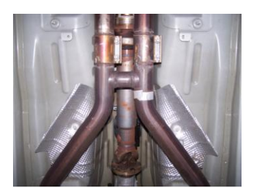
3. Loosen up the 2 clamps in the middle of the vehicle and slide them over the tailpipes. Now separate both tailpipes from mufflers and slide them out. Next remove the stock mufflers by sliding them out of the stock rubber grommets.

5. Install the passenger side tailpipe into muffler assembly using clamp #C to secure. Do not tighten. Use the stock clamp to secure the tailpipe to the stock h-pipe.