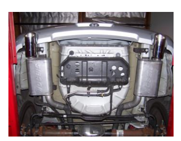
4. Now install the passenger side muffler assembly #B by sliding the metal hangers into the rubber grommets. Then do the same for the driver side muffler assembly #A.