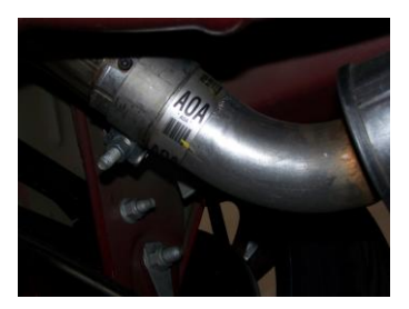
2. To remove your stock exhaust, unbolt the clamps by your rear mufflers using a 15mm wrench or socket.

1. Disconnect the negative battery cable before removal of OEM exhaust. This will allow the computer to reset and recognize the new exhaust. Lay out the exhaust on the floor so it looks like the drawing and compare parts with manual.