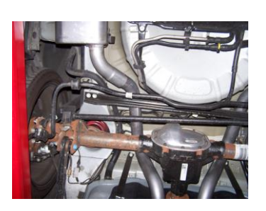
6. Now do the same procedure for the driver side tailpipe. Use clamp #C to secure the tailpipe to the muffler assembly and the stock clamp to secure it to the stock h-pipe.